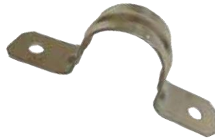
Two Hole Straps