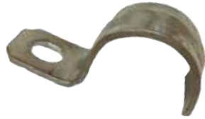
One Hole Straps