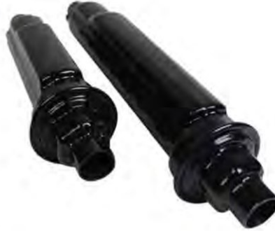
XJG EXPANSION JOINTS - 8" TRAVEL