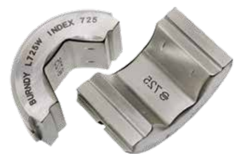
Wide L-dies (sold separately) can be used to save time and labor! Indicator marks on die set for ease of aligning connector properly. L725W shown.

Copper: 1/0 str. - 1000 kcmil Aluminum: 1/0 str. - 2300 kcmil ACSR: 1/0 str. - 2156 (84/19 str.) kcmil Aerial: Copper: 4/0 str. - 2500 kcmil Aluminum: 3/0 str. - 2500 kcmil Types: YTS, YTN, YNS, YNA, YNT, YNTA, YNU, YDS, YDN, YCS, YCA, YCU