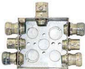
Wiring room using conventional steel connectors