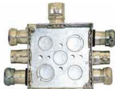
Wiring room using Space Saver Steel connectors