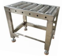
Optional output table