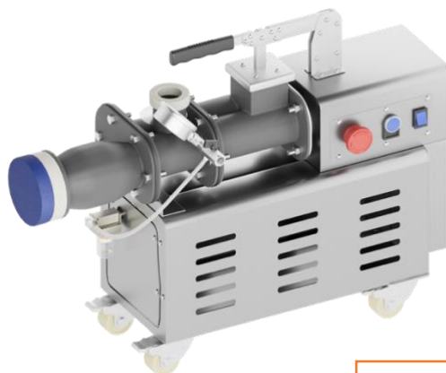
Fired Up Mini Pugmill

Note: There must be no foreign bodies or debris in the recycled clay.