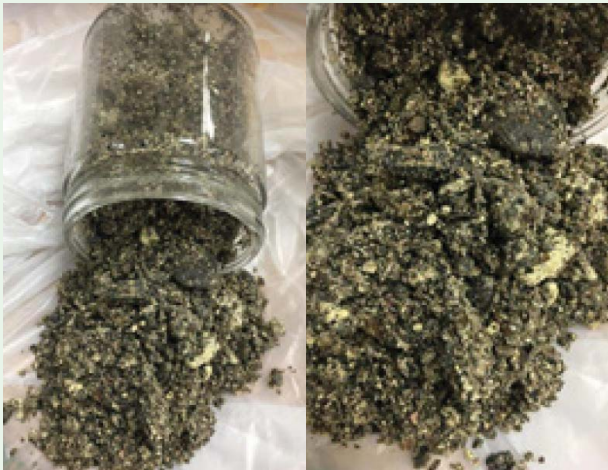
Figure 2: Sludge and struvite collected at head works of treatment plant one week after BioPro ULTRA treatment

The site operators have been very pleased with improvements in operation of the lift stations and WWTPs. They report that odors have been eliminated and sludge in lift stations has decreased dramatically.