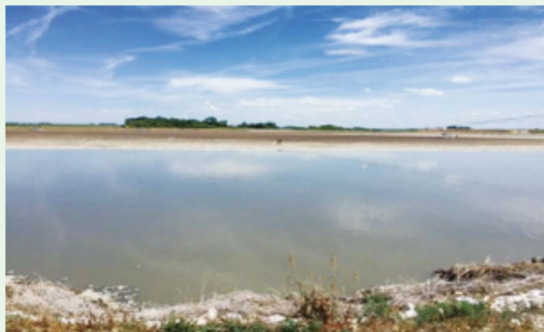
3 Weeks After Treatment