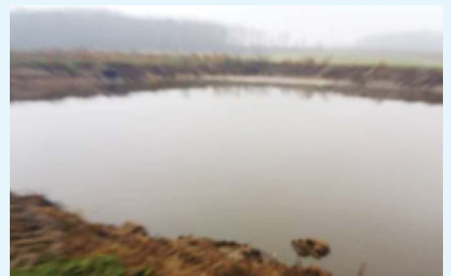
2 Months After Treatment