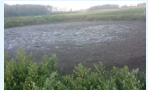
1 Month After Treatment