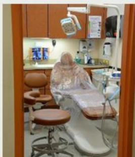
Department of Dentistry Four (4) Dental Chairs with units

This equipment does a supply count of items and it is able to scan new mothers after every birth to ensure nothing was retained during procedure/birth.