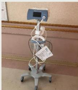
Department of Labor and Birth RF Assure Detector

Listed below are a few highlights of the medical equipment purchased during the passed years.