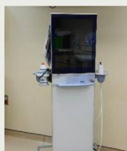
Department of Medicine Fibroscan 502

Provides cataract surgeons with diverse measuring options of the corneal surface to retina. Measures the front and back surfaces of the cornea, cornea thickness and total refractive power.