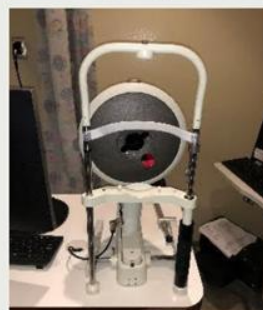
Department of Ambulatory Care Pentacam AXL Machine

This equipment provides real time three dimensional view of the position and configuration of the endoscope inside colon.