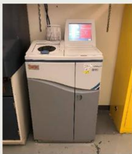
Department of Pathology Tissue Processor

Equipment is used to process biopsies tissue in order to make slides for pathologist use.