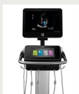
Department of Medicine Sonosite Point of Care Visualization Equipment

A point of care medical device that enables providers to perform a non-invasive test that helps assess the health of a patients liver.