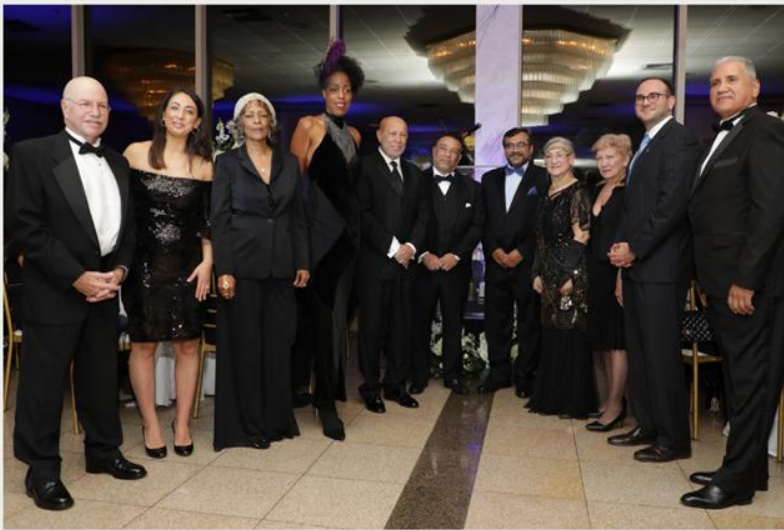
The Woodhull Auxiliary Board

Each year, the Auxiliary underwrites the Digital entertainment system for inpatient and outpatient Pediatrics with free access to 24 hours child specific programming in both English and Spanish and sponsors the Children Holiday gift giving. In addition, the Auxiliary supports the outreach activities and important health screenings to keep our communities healthy.