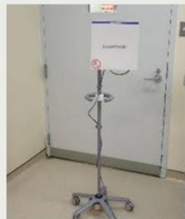
Department of Ambulatory Care Two (2) Scopeguide Processor Units

Equipment is used to process biopsies tissue in order to make slides for pathologist use.