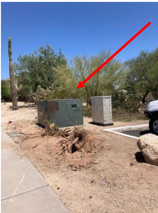
Green metal electric transformer box (note destroyed tree directly in path of electric transformer box) completely uprooted. Had tree not been there to stop vehicle, vehicle would've crashed into electric transformer box.

There have been 5 such accidents at this exact location thus far. The most recent accident 5-27-2022 vehicle almost crashed into large electric transformer and had tree not been there in its direct path to stop the vehicle it would've crashed at high speed into the electric transformer (see photo showing green metal electric transformer box). Two other accidents at this same location both vehicles crashed into the house at 8918 N Joanna Dr (house shown in this photo). One such option is placing large boulders as a barrier; the other is a guard rail. We would like to meet with you to discuss our options. A few years ago after a vehicle jumped the curb it crashed into the home (seen here in the photo 8918 N Joanna Dr) causing a lot of damage. As a result PIMA did install an additional chevron sign at the location. Although these chevron signs posted along this blind curve help prevent accidents, they are not enough. Last year a vehicle crashed into the chevron sign which PIMA repaired. Law enforcement suggested using a boulder barrier but we are unsure of the liabilities and laws for this. A guardrail would be another solution or another viable recommendation from PIMA.