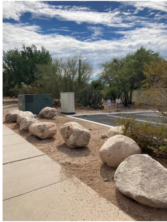
Boulders also placed boulders in front of bushes, because bushes won't stop vehicles