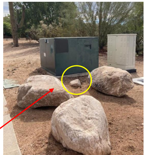
Smaller rock circled in yellow marks exact spot where tree had been that prevented out of control vehicle from crashing at high speed into electric transformer back in May (see attached incident report dated 5-28-22)