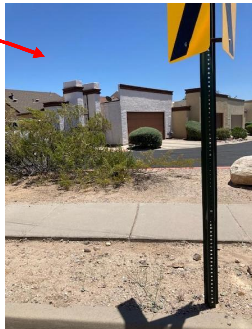
House at 8918 N Joanna Dr has been crashed into on 2 previous occasions causing serious property damage and one of the homeowners to move out.