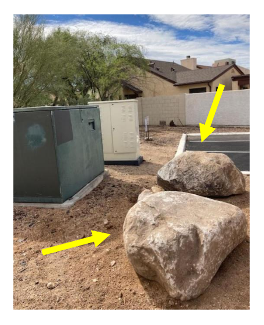
Boulders placed around front and side of electric transformer where vehicle jumped curb back on 5-28-22.