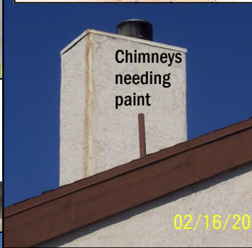
Chimneys needing paint