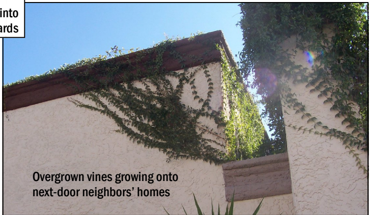
Overgrown vines growing onto next-door neighbors' homes