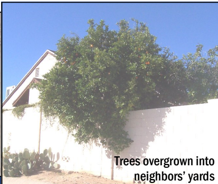
Trees overgrown into neighbors' yards