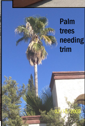
Palm trees needing trim