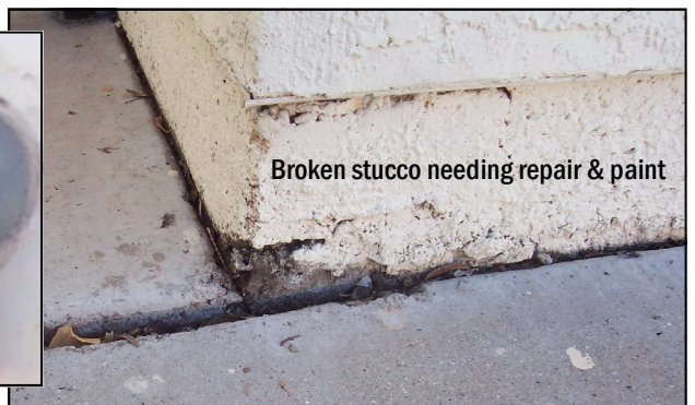
Broken stucco needing repair & paint