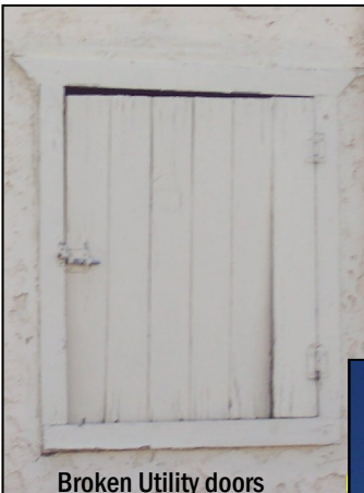
Broken Utility doors

The Annual Walk Around was done Saturday, Feb. 16th. Homes with exterior walls, stucco, parapet, fascia boards, outdoor light fixtures, utility doors, garage doors, and overgrown vegetation in need of maintenance or repair were noted. Per Art V, Sec 5.04B of the DCC&R's, the Board must use a reasonable high standard so that the Lots as a whole will reflect a high pride of ownership. Because of the well maintained homes in our community over the years, the Villas' home $ values remain consistently high. (See page 4 for Handyman & Landscaping Helpers)