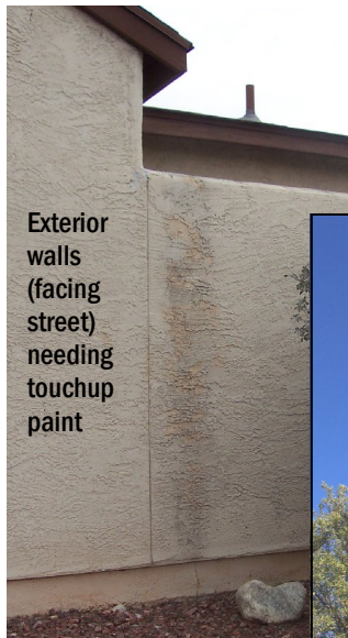
Exterior walls (facing street) needing touchup paint