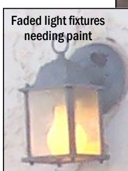
Faded light fixtures needing paint