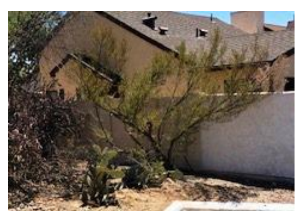
9. Removed debris, dead bushes and prickly pear from common area (behind Doria along Camino de Oeste) **BEFORE** AFTER**