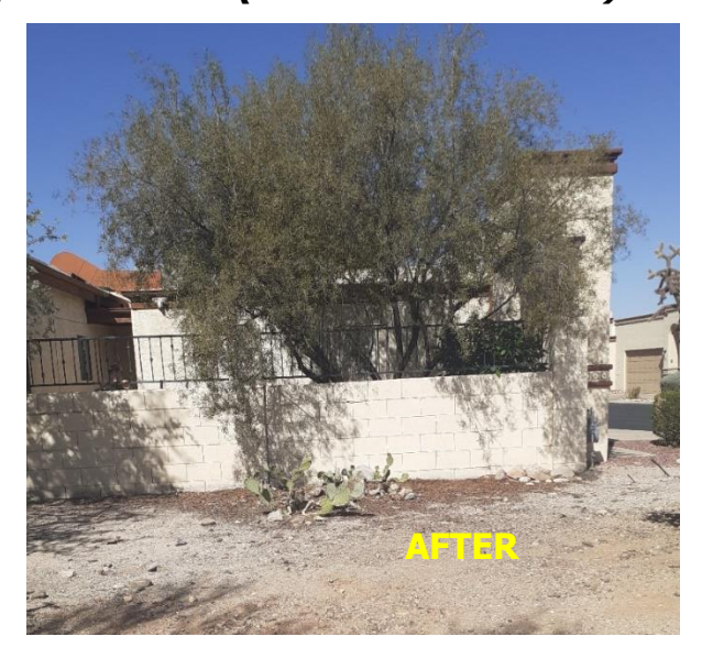
2. Dead saguaro in common area (Lessing Ln) reported by homeowner. (Removed 4-7-2021)