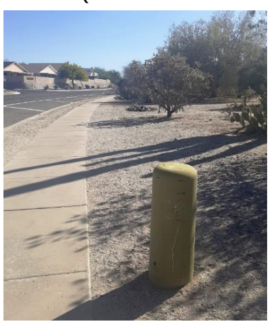
5. Villas' Volunteer yellow-Vest Crew – pruned Yucca (corner of Joanna & Doria)