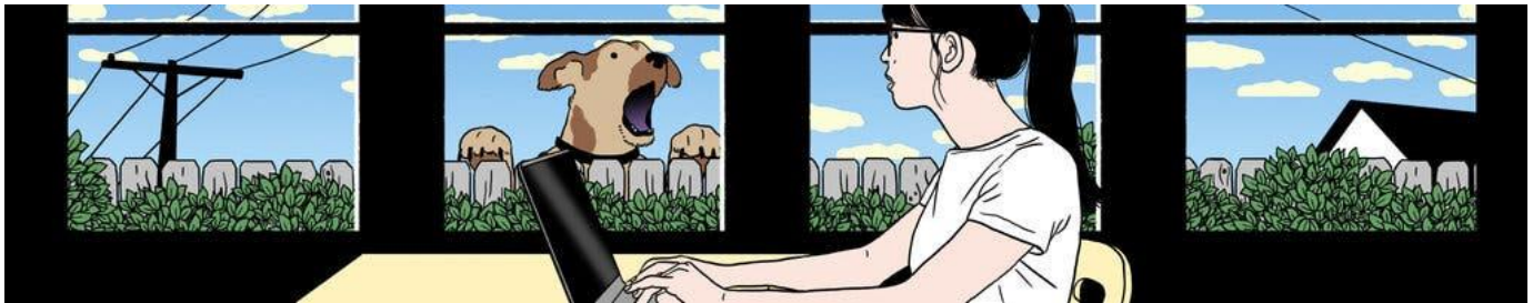
Illustration By Nadia Pillion

We adore dogs, but excessive dog barking is definitely not allowed in Countryside Villas. DCCRs Article II “General Restrictions,” Section 2.03. “No animal shall be allowed to become a nuisance;” and Rules & Regulars 4. Pets “Excessive pet noise will not be tolerated. No animals will be allowed to become a nuisance.” Please don’t leave your dog outside to bark for over 10 min. Generally, excessive barking involves a dog repeatedly barking for prolonged periods of time that interfere with neighbors being able to enjoy their own property. Homes are in close proximity to each other, so a dog barking outside right next door is just a few yards away from a neighbor’s bedroom or living room window.