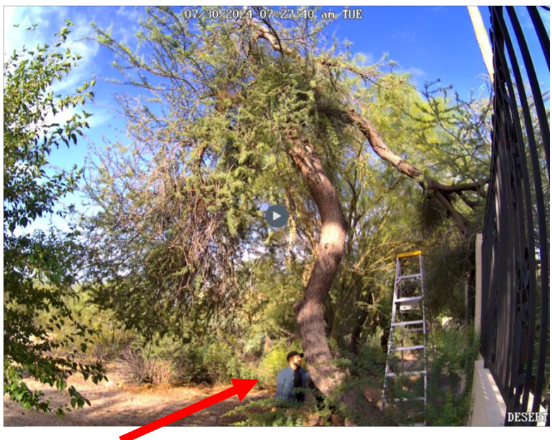
AFTER: removed huge branches, and cleared from backyard and trimmed