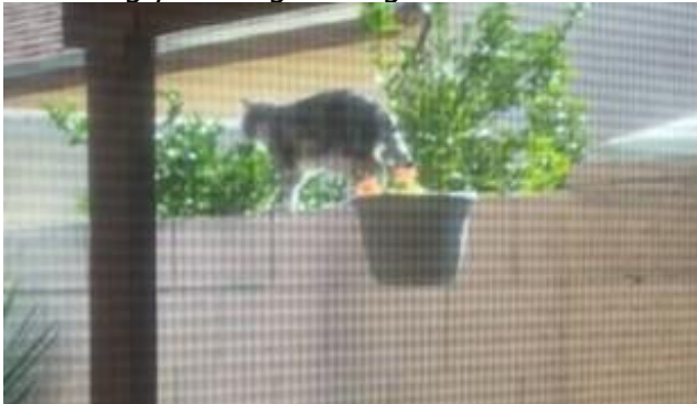
Grey tabby kitty hopping wall of neighbor's yard

Cat Complaint: Grey tabby cat belonging to a homeowner on Doria. Please don't let your cat loose unattended in your back yard. You may not be aware that your cat is hopping your wall and using your neighbor's garden as a litter box.