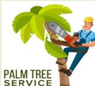
PALM TREE SERVICE