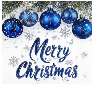
Blue Christmas Card, by Mementobloom

the community, the monthly dues were raised to $67 per month starting January 1, 2026. (DCCRs VI, Section 6.03-A)