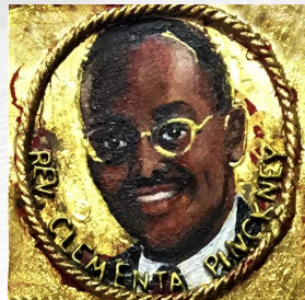
The Honorable Reverend Clementa C. Pinckney

Reverend Pinckney was ordained into the ministry at 18 and became the youngest member of the South Carolina State Legislature at 23. He was leading Mother Emanuel into the future with education and achievements enough for several lifetimes. He loved his family infinitely. Clementa Pinckney lived on God's time.