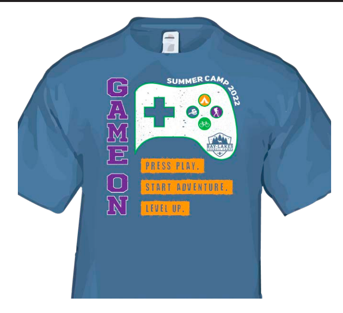
But hurry! Order deadline: May 1, 2022