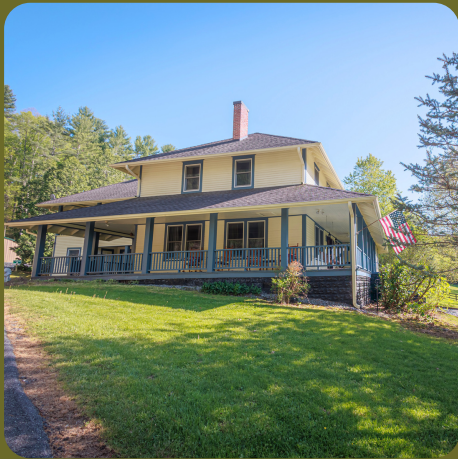
The Stines House