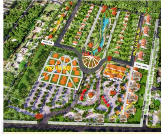
CREATE & BUILD ... PINE ISLAND PARADISE . WWW.PINESLANDRESORTS.COM