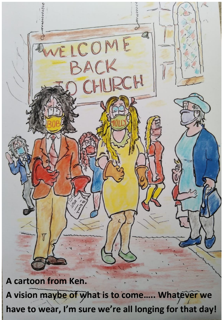
A cartoon from Ken.

A vision maybe of what is to come..... Whatever we have to wear, I'm sure we're all longing for that day!