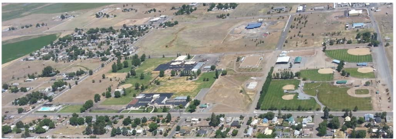
Photo that is being used to accompany the Proposition 68 Grant Request for the Pool and Community Center. It sure showed off the Rotary Fields beautifully. Thought you all would like this picture!