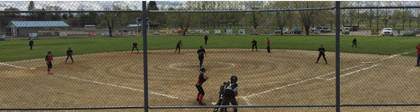
Rotary Youth Park Outstanding ball and soccer fields for local youth and adults