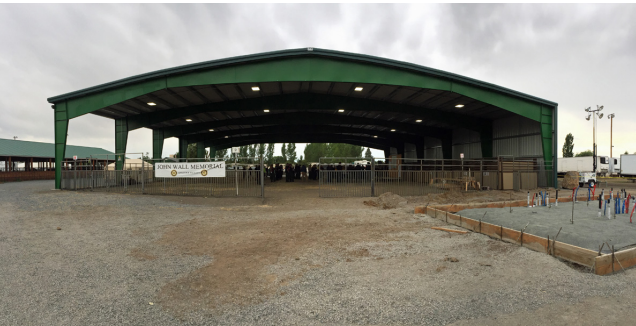
John Wall Memorial Livestock Facility Home of the Modoc County Junior Livestock Show and Sale where Local 4-H and FFA members exhibit their animals and participate in a livestock judging contest.