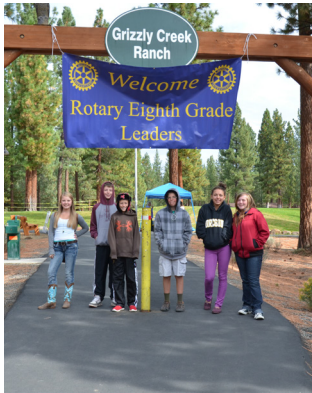
Modoc Middle School Learning today to lead tomorrow