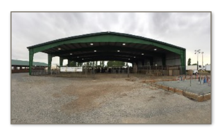
Junior Livestock Barn

Once again Rotarians took to the road, this time off to Baja for a hands-on basic education and literacy project. In partnership with the Rotary Club of San Felipe, B.C., Mexico, Rotarians provided a covered learning environment that allows students to be engaged in studies for a full school year.