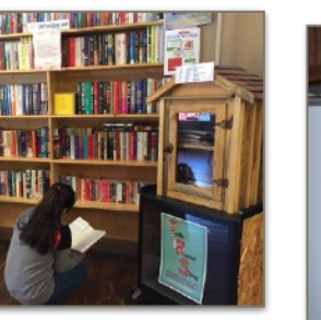
Alturas Little Free Library