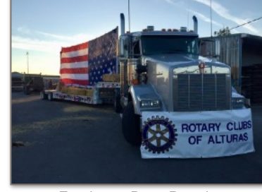
Fandango Days Parade