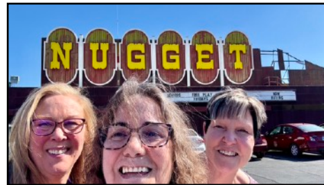
The Gambling Trio !! Very Lucky!