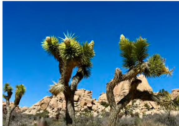
A nice trip to Joshua Tree National Park