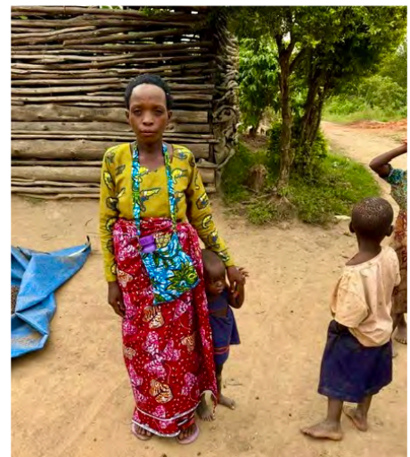
Batwa mother in colorful textile clothing and children