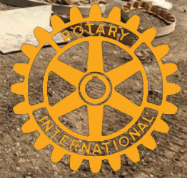
ARCF Financial Assets - 2018