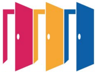
Rotary Opens Opportunities

Together we see a world where people unite and take action to create lasting change - across the globe, in our communities, and in ourselves.