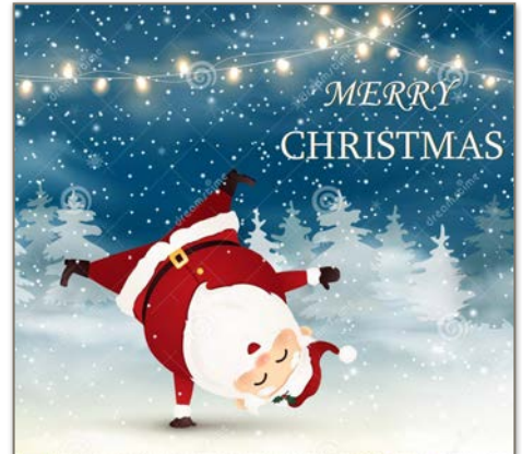
Rotary Club of Alturas Celebrates the Holidays with a December Lunch ! YUM!!