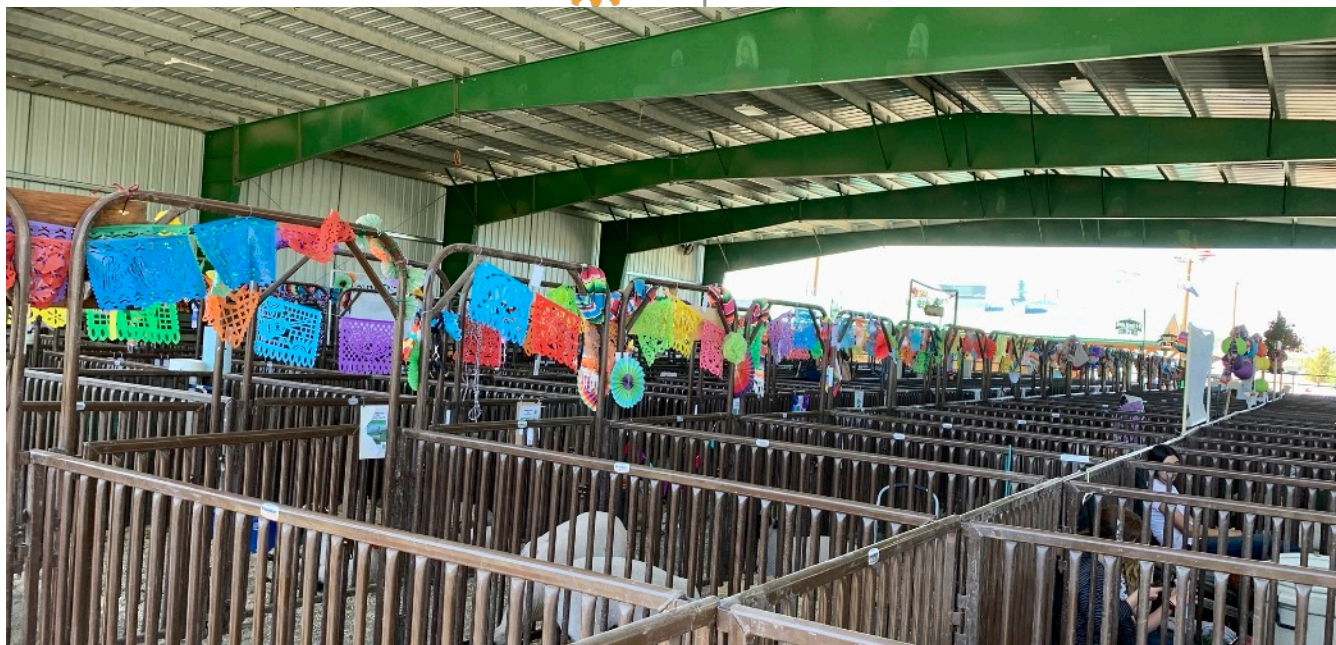
Junior Livestock Barn and Pens Courtesy of Rotary of Alturas John Wall Funds