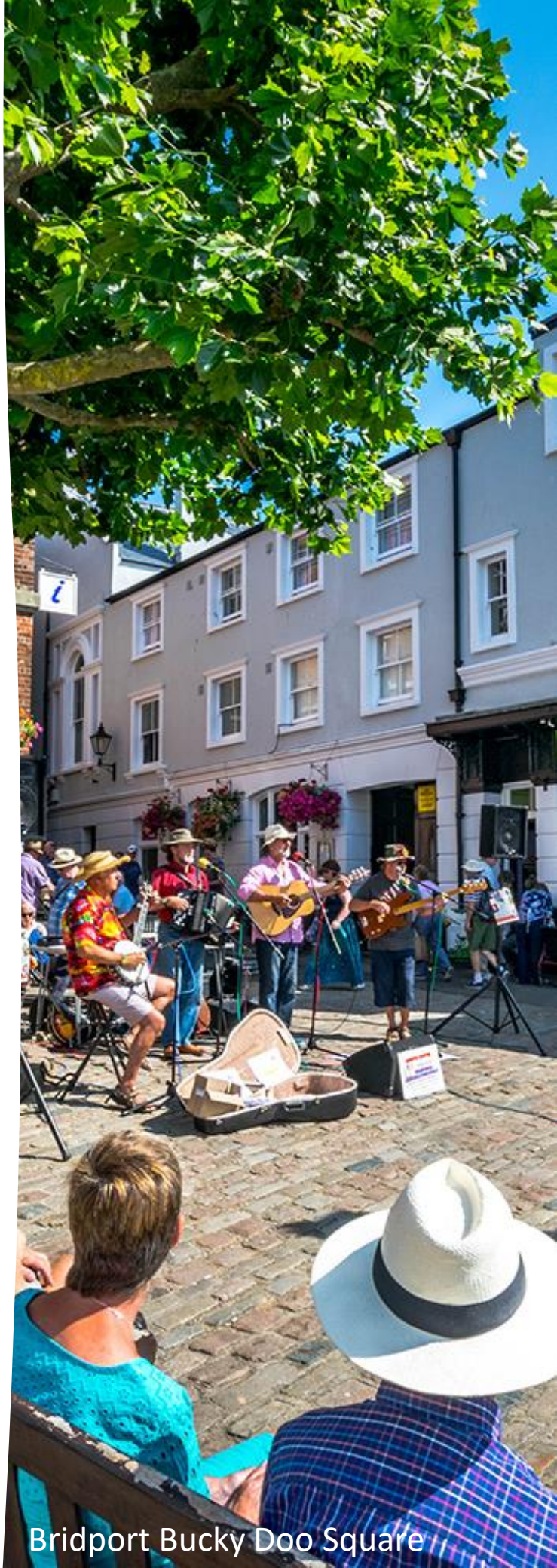
Bridport Bucky Doo Square