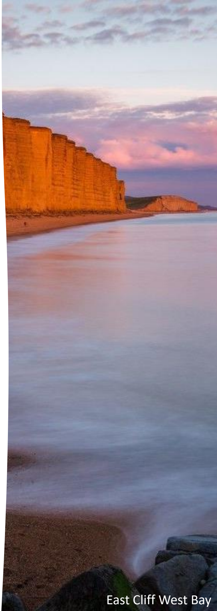
East Cliff West Bay