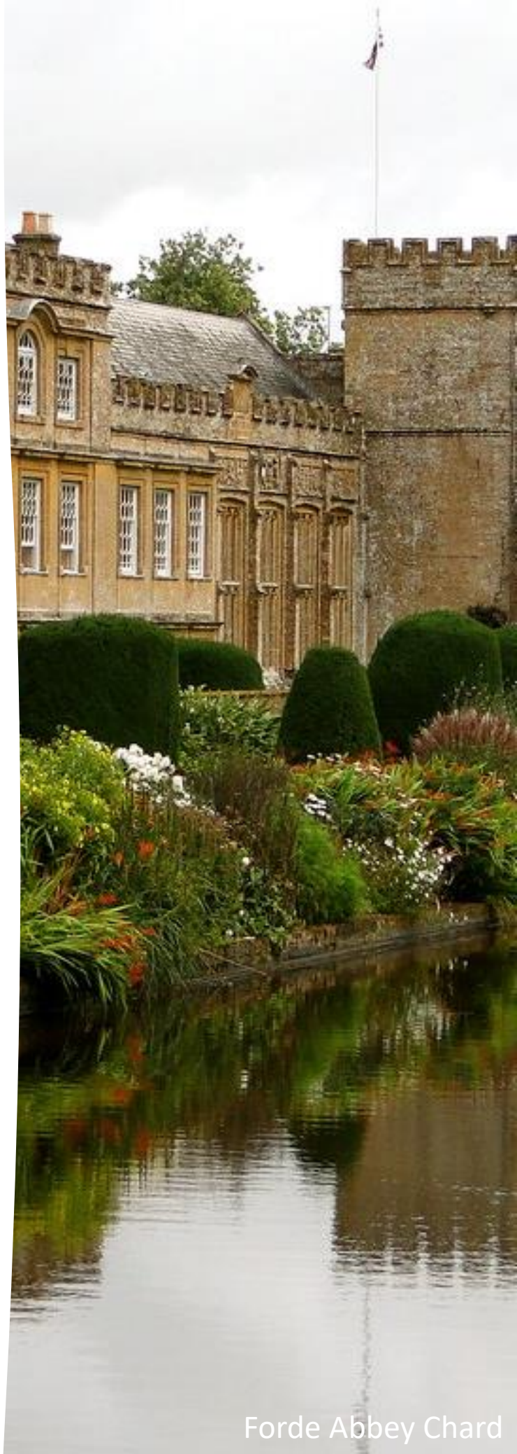
Forde Abbey Chard