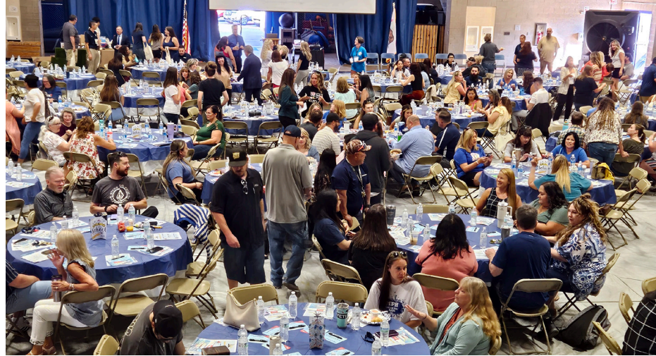
The gym at Rim of the World High School was the site of the welcome back breakfast on Aug. 9.

"Build trust with one and you inspire many. Why are we in public education?"