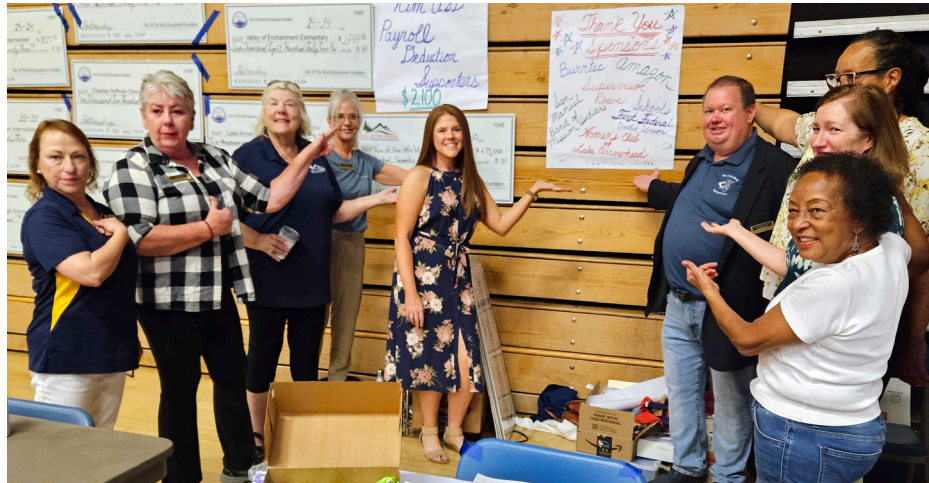
Members of the Rim of the World Educational Foundation point to the checks representing the funds they donated to the Rim schools last school year.