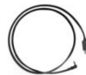
Programming Cable (USB Port) PC45