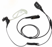
Detachable Earpiece with Transparent Acoustic Tube EHN22