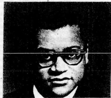
James M. Lawson, Keynote, Nashville