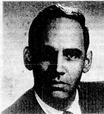
William Kunstler, ACLU lawyer and author