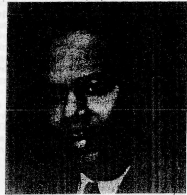
James Farmer, National Director CORE