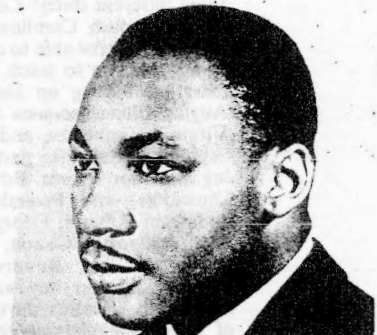
Martin Luther King, Jr., President of SCLC