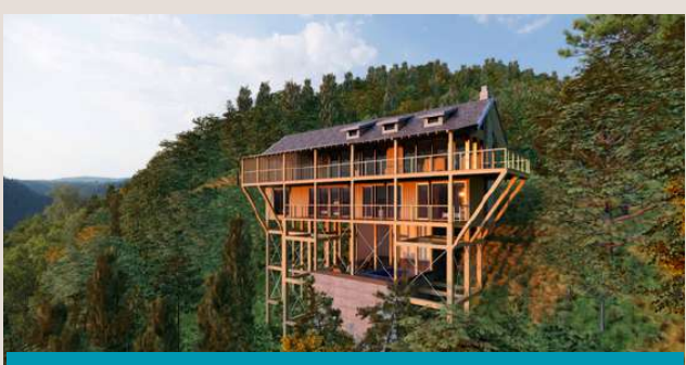
PLAN D - 5 BEDROOM TRADITIONAL