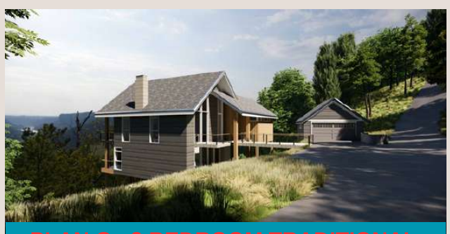
PLAN C - 3 BEDROOM TRADITIONAL