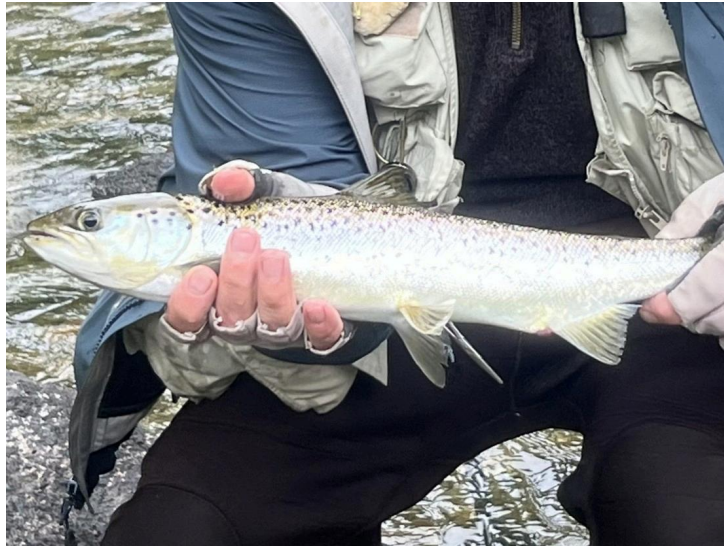
Land Locked Salmon - Grand Lake Stream, ME