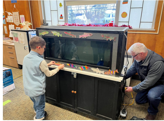
New TIC tanks at Remsen Elementary and Harts Hill Elementary