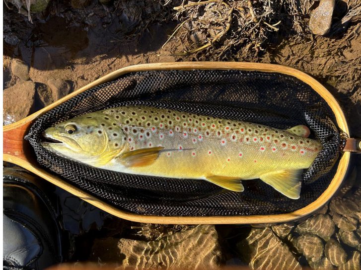
West Branch Delaware Brown