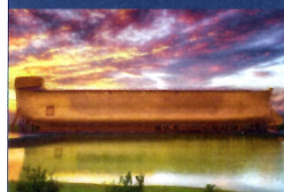
Enjoy a Visit to the Famous Ark Encounter