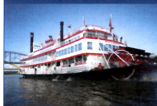
Enjoy a BB Riverboats Sightseeing Cruise