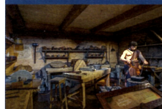
View from Inside the Ark Encounter