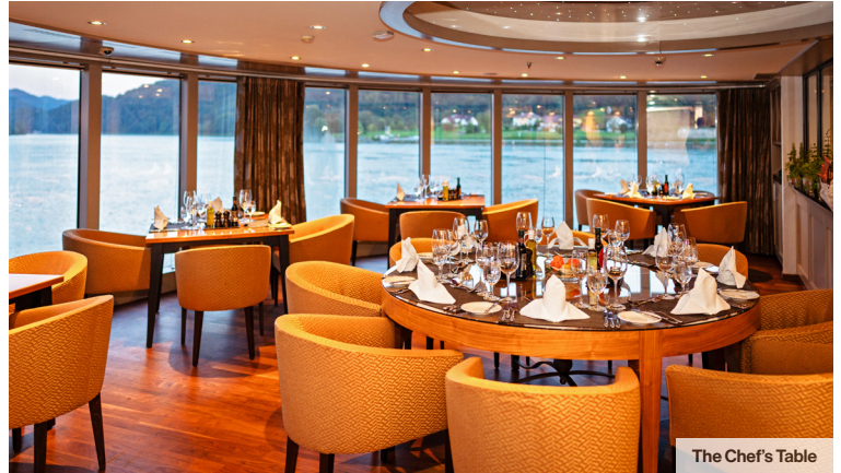
The Chef's Table