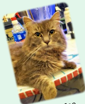
Smokey Joe, 2022

So, on June 16 th , we temporarily stopped registering pets. It was time to create a new program model that would help a growing number of pets while maintaining our fiscal health.