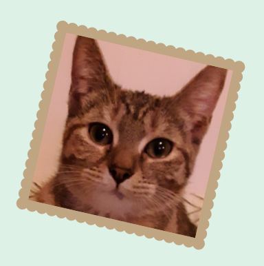
Puppy? Did you ever meet a free-thinking kitten named Puppy! We did!

Fixing to Help pets are special in every way. You can hear it in their parents' voices - their babies mean the world to them. Our donors help keep the human/animal bond unbroken.