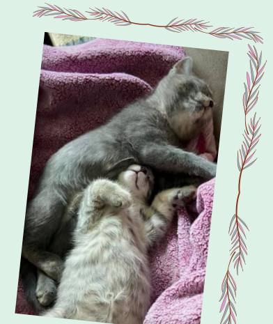
Blanche and Betty White worked extremely hard to grow big enough to be spayed. They succeeded!

To date, 61% of surgeries have been for cats, and 39% for dogs. *Year 3 numbers represent six weeks of sponsorships.