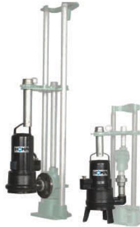
Order # 88470150 88470160 Other GRP to Myers adapters