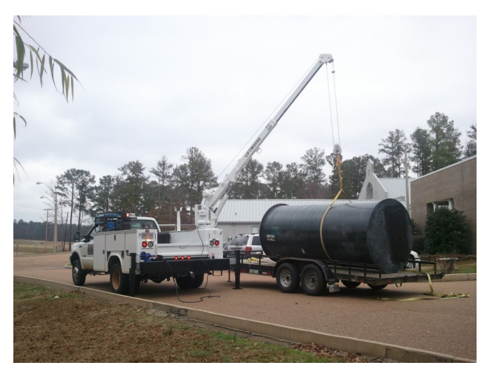
ABOVE: One of our standard 12' basins being delivered to the job site.