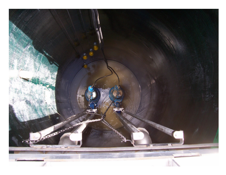
We keep 24x48, 24x60, and 24x72 in stock and ready for immediate delivery. Larger designs allow 2 weeks for delivery.

Just let us know how much and how far you need to pump and let us do the rest. Magnolia Pump is proud to offer full service in house design of you low pressure sewer system. Let us put our experience to work for you!