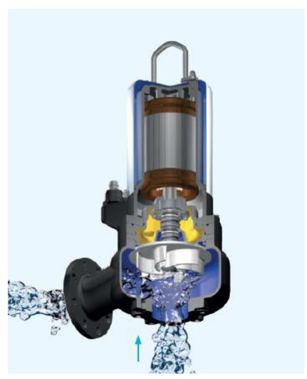
With the optimized Vortex flow path, clogging is prevented and wear is minimized.

Innovative impeller design is provided in cast iron as standard. Hardened iron or rubber coated options also available.