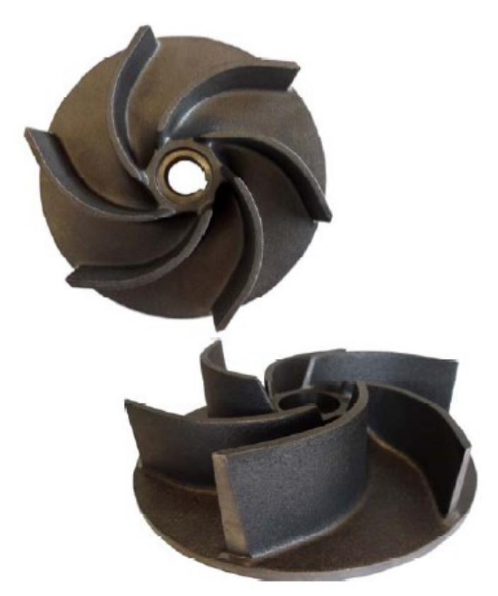
HOMA AVX technology is an excellent solution for the growing challenge of today's waste water streams.