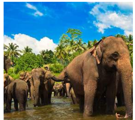
YALA NATIONAL PARK

WHEN : ROUND THE YEAR WHERE : SRI LANKA DURATION : 14 Nights / 15 Days LIMITED EDITION JOURNEY for SIX to EIGHT PERSONS (MAXIMUM)