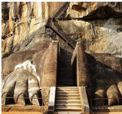
SIGIRIYA ROCK FORTRESS