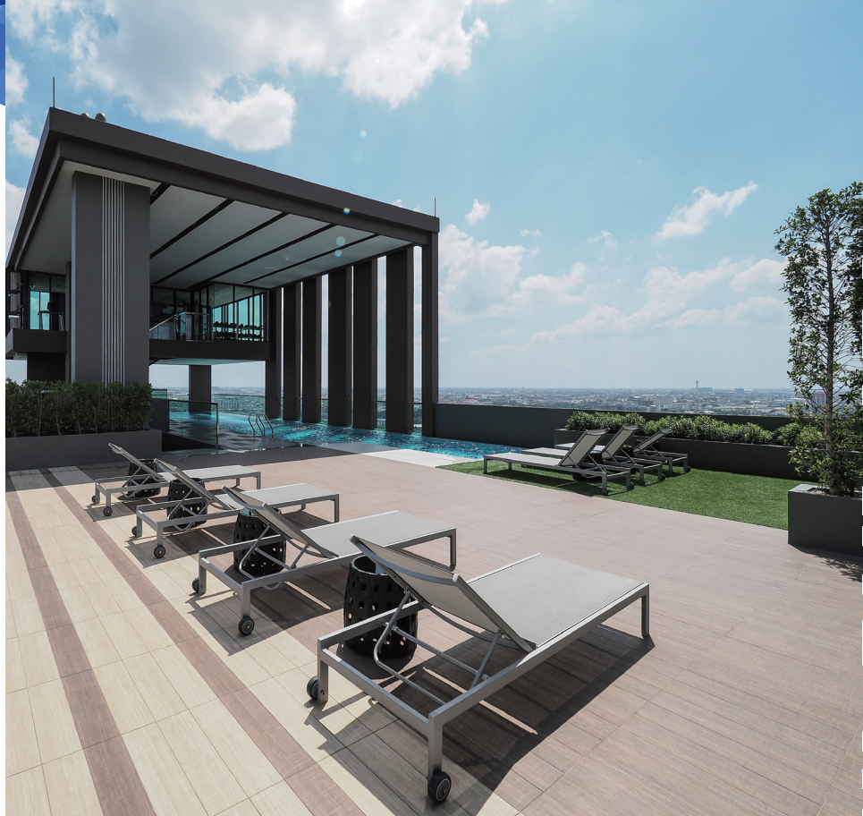
▲ Podium Deck