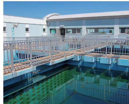
▲ Water Tanks and Treatment Tanks