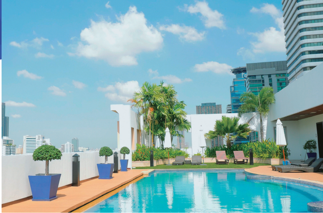
▲ Podium Deck