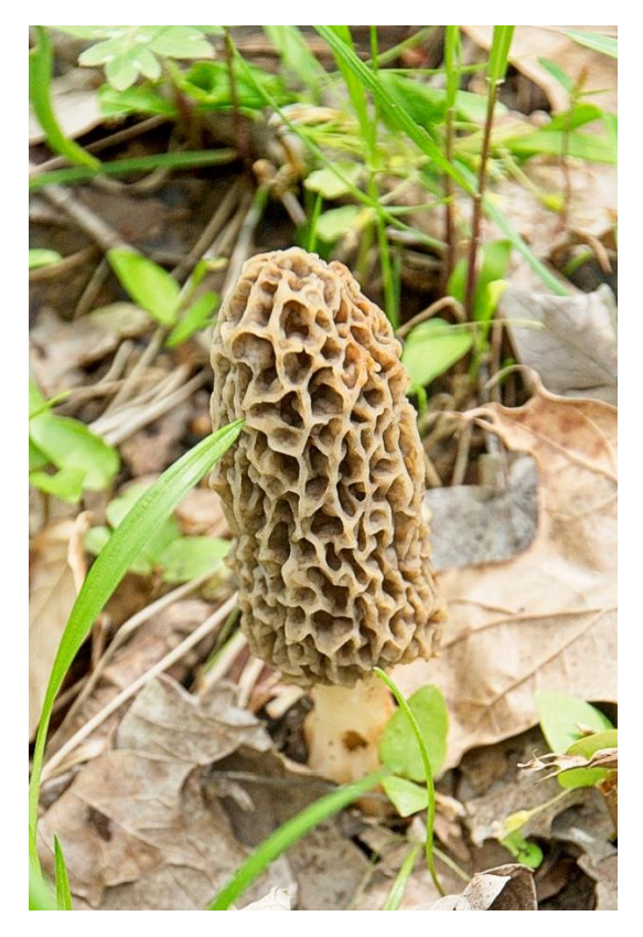
Earthstock Earth Day 2019