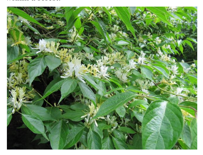
Amur Honey Suckle in bloom. (Lonicera maackii)

Some invasive plant species are more aggressive than others. For example, common dandelion is not native to North America, yet they typically only compete with lawn species. On the other hand, Tree of Heaven can grow in a variety of habitats and reproduce at a rapid pace through seeds or their root system. When this happens, the invasive plant outcompetes native plants for nutrients and growing space. This includes all types of natives, from spring wildflowers to the biodiversity of trees within a forest.