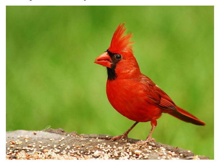
Male Northern Cardinal. (Cardinalis cardinalis) (https://commons.wikimedia.org/wiki/File:Cardinal.jpg

Ohio's state bird, the Northern Cardinal, is one of many wildlife species that is negatively impacted from invasive species such as honeysuckle. Even though honeysuckle provides berries for birds to eat, they lack the nutrition that native berries have to keep birds healthy.