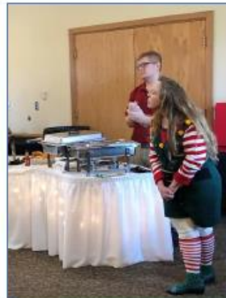
Brunch with Santa at Voice of America MetroPark-Ronald Reagan Lodge 12/15/19