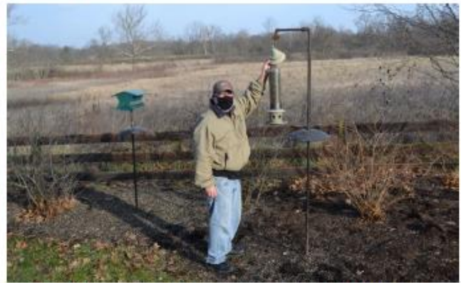
Feeder Fill Monitor at Forest Run MetroPark – Timberman Ridge area

**Keep sending in your pictures! We love to see them...and share them!**