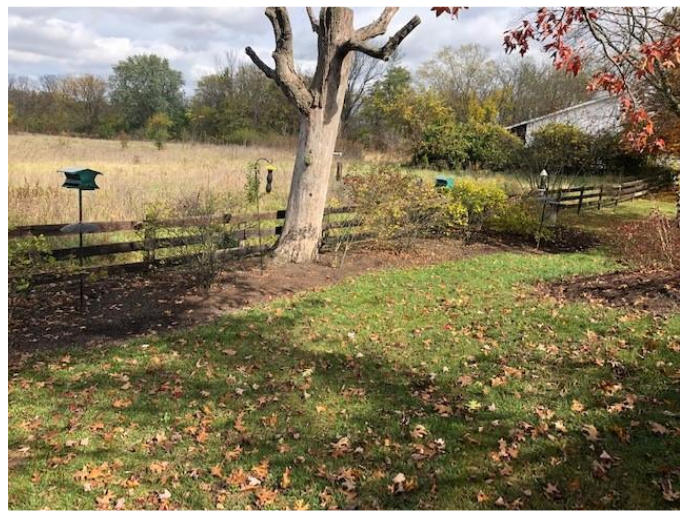
Feeder Location and Maintenance

Not all birds fly to warmer climates for the winter. Many birds stay here and brave the elements. Birds have fewer food sources in the winter as insects are fewer in number and plants are not producing seeds and berries. Most birds will get by just fine on left over seeds and fruits produced throughout the spring and summer, but they will not turn their beaks up at a feeder full of seeds or suet cakes! This provides you with the perfect opportunity to do some birding without even leaving your home.