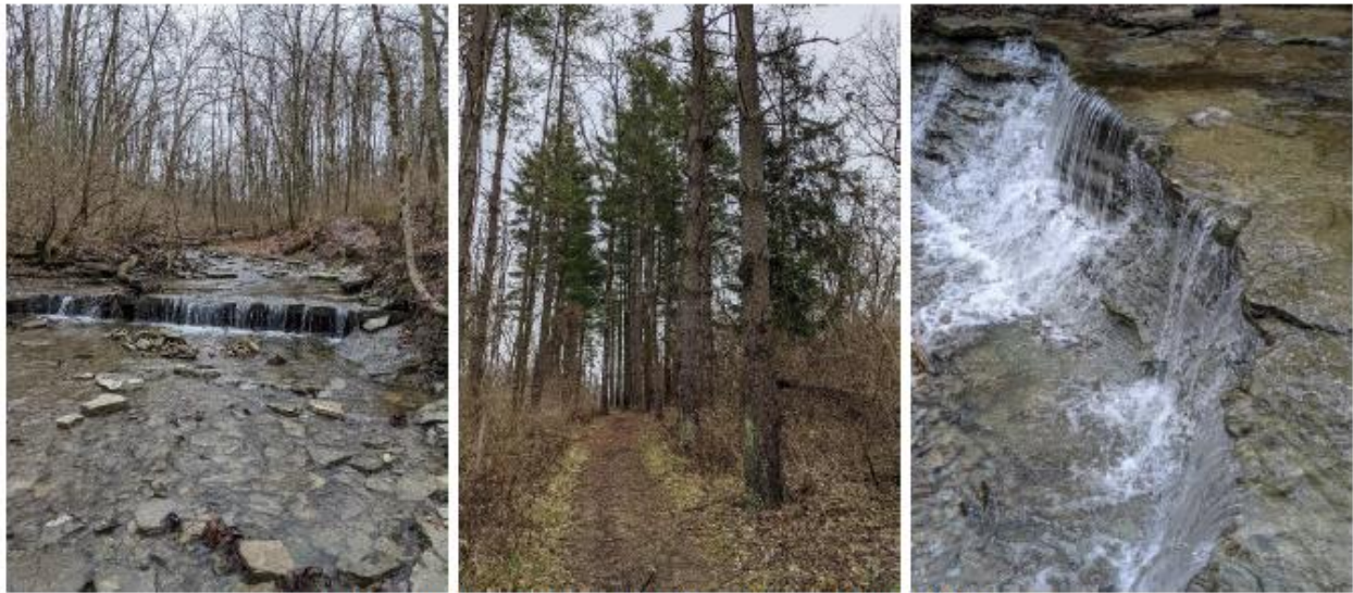
Rentschler Forest MetroPark – Reigart Road area.