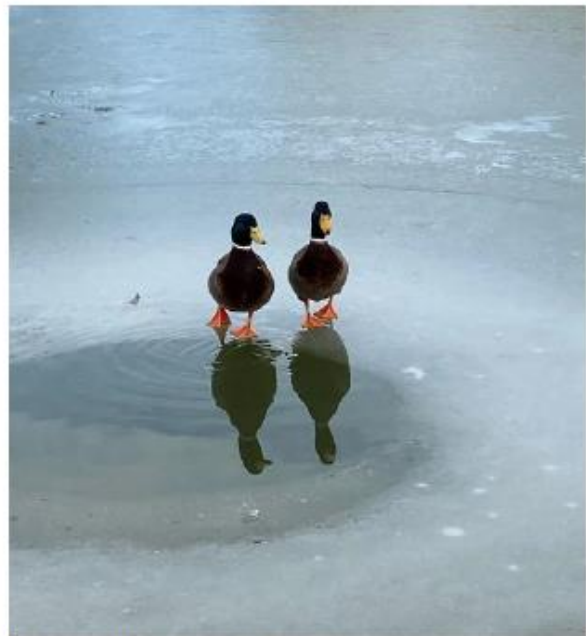
Elk Creek MetroPark – Meadow Ridge area.