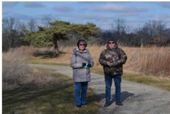
Trail Maintenance Stewards at Elk Creek MetroPark – Meadow Ridge area